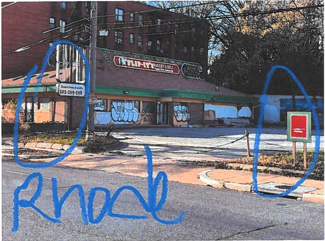
Photo 2: Sign on Rhode Island Ave., NE (taken from Rhode Island Ave.)