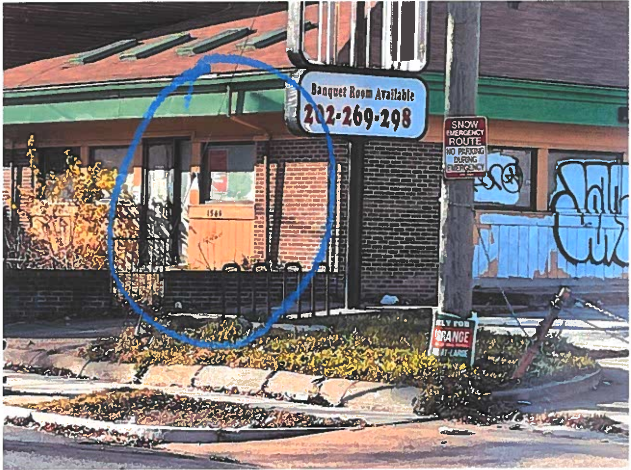
Photo 1: Sign on Existing Structure (taken from Rhode Island Ave., NE)