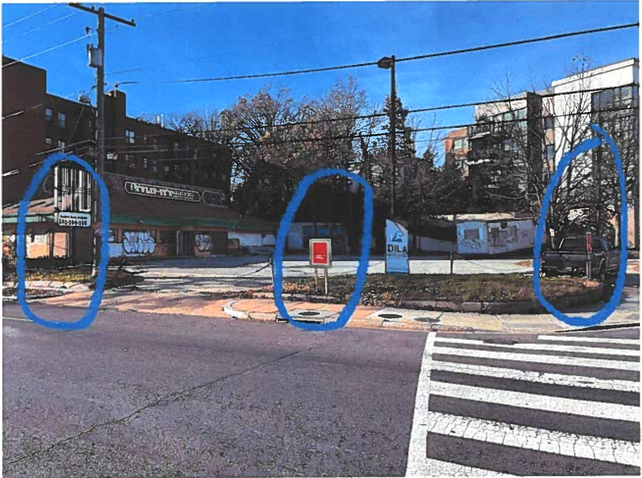
Photo 4: Signs visible from the intersection of Rhode Island Ave., NE and 16 th Street, NE